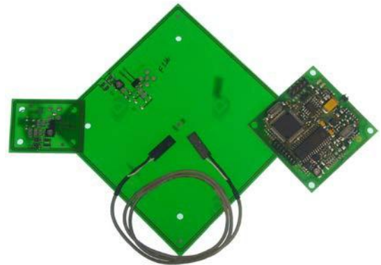
As external antennas, two 50Ω antennas ID ISC.ANT40/30 and ID ISC.ANT100/100 are available.