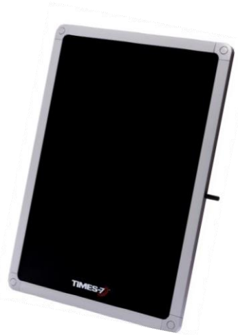
The SlimLine A6032

Proven in a diverse & growing range of markets, applications include: retail & customer interaction, conference & people tracking, race timing, baggage handling, and logistic & supply chain asset management.