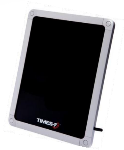
The SlimLine A6031

Our SlimLine range of antennas is unique in the RFID industry offering high levels of performance & reliability in an aesthetically superior form factor. Proven in a diverse & growing range of markets, applications include customer interaction, conference people tracking, race timing, inventory handling, and logistic & supply asset management.