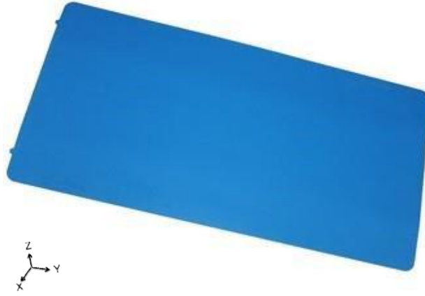
The A5530C Ground Mat

Proven in a diverse & growing range of markets, applications include: retail & customer interaction, conference & people tracking, race timing, baggage handling, and logistic & supply chain asset management.