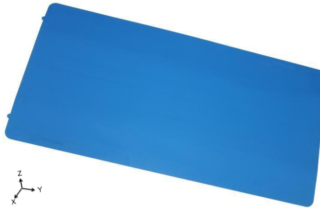
The A5530 Ground Mat

Proven in a diverse & growing range of markets, applications include: retail & customer interaction, conference & people tracking, race timing, baggage handling, and logistic & supply chain asset management.