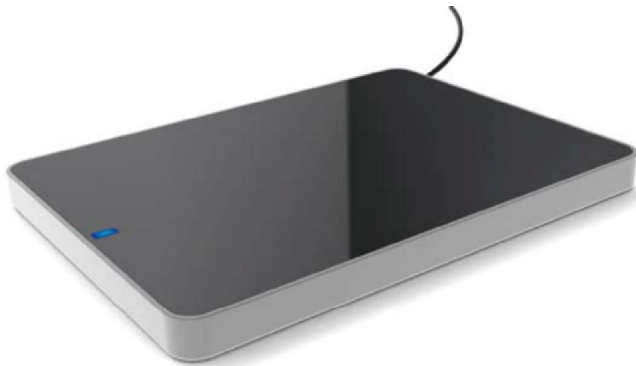
ID ISC.ANTS370/270-A Shielded, external antenna with coaxial cable

The antenna ID ISC.ANTS370/270-A has an included coaxial cable to connect it directly to a reader. To indicate different conditions the blue LED could be powered with a DC voltage on the antenna output of the reader.